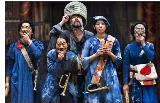
Coriolanus performed in Japanese by Chiten at Shakespeare's Globe. Part of Globe to Globe Festival, 2012 www.shakespearesglobe.com