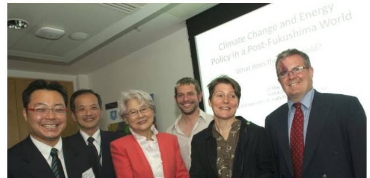
International Symposium: Climate Change and Energy Policy in a Post-Fukushima World - What does the future hold?