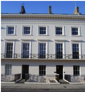
Daiwa Foundation Japan House, Regent's Park